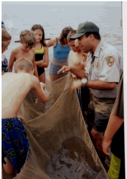
SEINING FOR MARINE LIFE

Enrollment is extremely limited. Enroll as soon as possible.