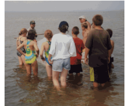
AT THE FIRE ISLAND NATIONAL SEASHORE

CHILDREN WHO ARE CURRENTLY IN 4TH OR 5TH GRADE ARE INVITED TO JOIN IN THE FUN!