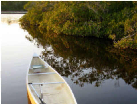
EXPLORING THE CARMANS RIVER

APPLICATION FORMS ON-LINE AT BELLPORTBAYSF.ORG CLICK ON "ENVIRONMENTAL CAMP"